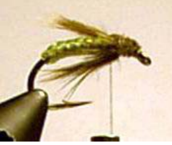
Step 4 Pull saddle hackle back so it lies