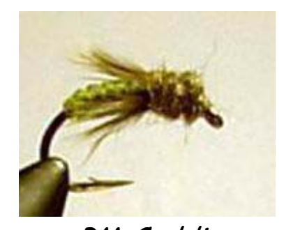
PM Caddis Hook: Curved Nymph size 8-10 Thread: 6/0 Tan Body: Chartreuse Larva Lace Hackle: Brown Hen Saddle Head: Dubbed Hare's Ear or Squirrel Blend Tan