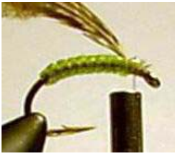
Step 3 Tie in brown saddle hackle and make three or four wraps; tie down cut excess material. back along body making a collar.