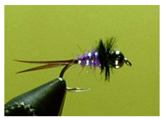
Pseudo Stone By Jerry Darkes

Hook: Daiichi #1530, sizes # 10 - 16 Rib: Krystal Flash, pearl Thread: 6/0 Black Collar: Ostrich herl, black