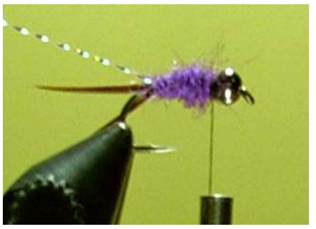
Step 2 Dub purple Pseudo Seal dubbing onto hook and form a tapered body.