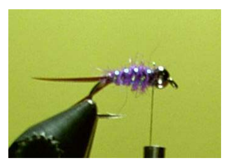
Step 3 Wrap Krystal Flash over the purple Pseudo Seal dubbing.