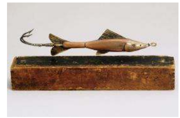
The Giant Haskell Minnow. In 2003, Lang's sold one at auction for $101,200, setting a record at the time for antique fishing gear.

https://fishbrain.com/blog/fishbrain/these-old-fishing-items-are-secretly-worth-a-fortune