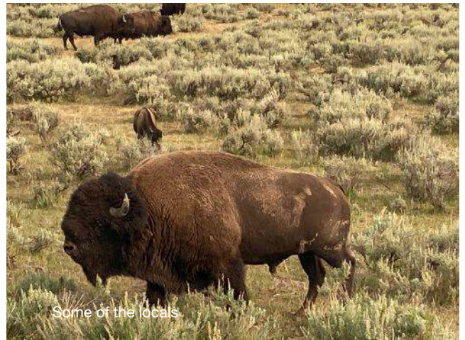
Some of the locals