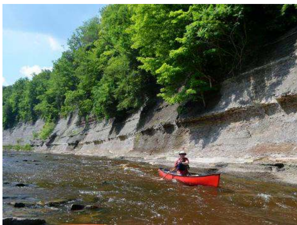
Paddling the wild and scenic section of the Grand River in Lake County, downstream of the Harpersfield Covered Bridge. A good takeout point is Riverview Park, about 8 miles downstream. This section has some rapids, steep shale cliffs and isolation through the Grand River gorge. More information is at: https://ohiodnr.gov/wps/portal/gov/odnr/go-and-do/plan-a-visit/find-a-property/grand-scenic-river .

Sponsorship options are available. Please consider supporting this public-private partnership in protecting Ohio's waterways.