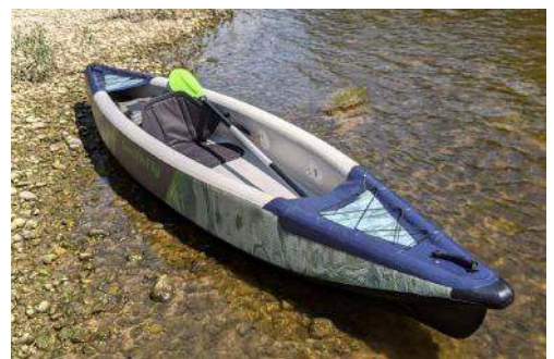
Those who join OSRA in 2022 will be eligible to win this inflatable kayak and other supplies from Smithfly Designs.