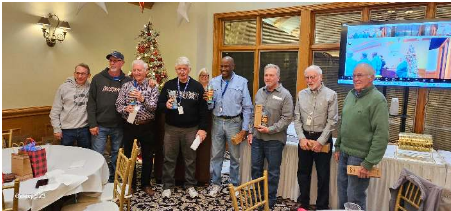
Here's a link to a Facebook photo album from the December meeting . . . https://www.facebook.com/media/set/?set=a.1101768208488317&type=3