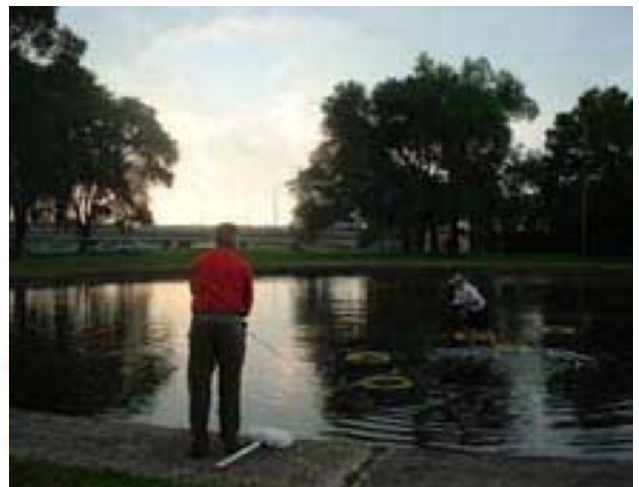
Deeds Park Casting Pond